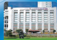
China Medical University Children's Hospital