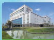
Tainan Municipal An-Nan Hospital- China Medical University