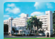
China Medical University Beigang Hospital