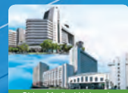
China Medical University Hospital