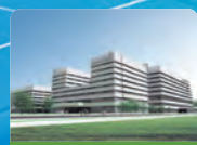
China Medical University Hsinchu Hospital